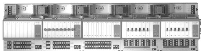
Fig. 2. CentraLine CLIO modules

See also LonWorks Bus I/O Modules – Product Data (EN0Z-0980GE51).